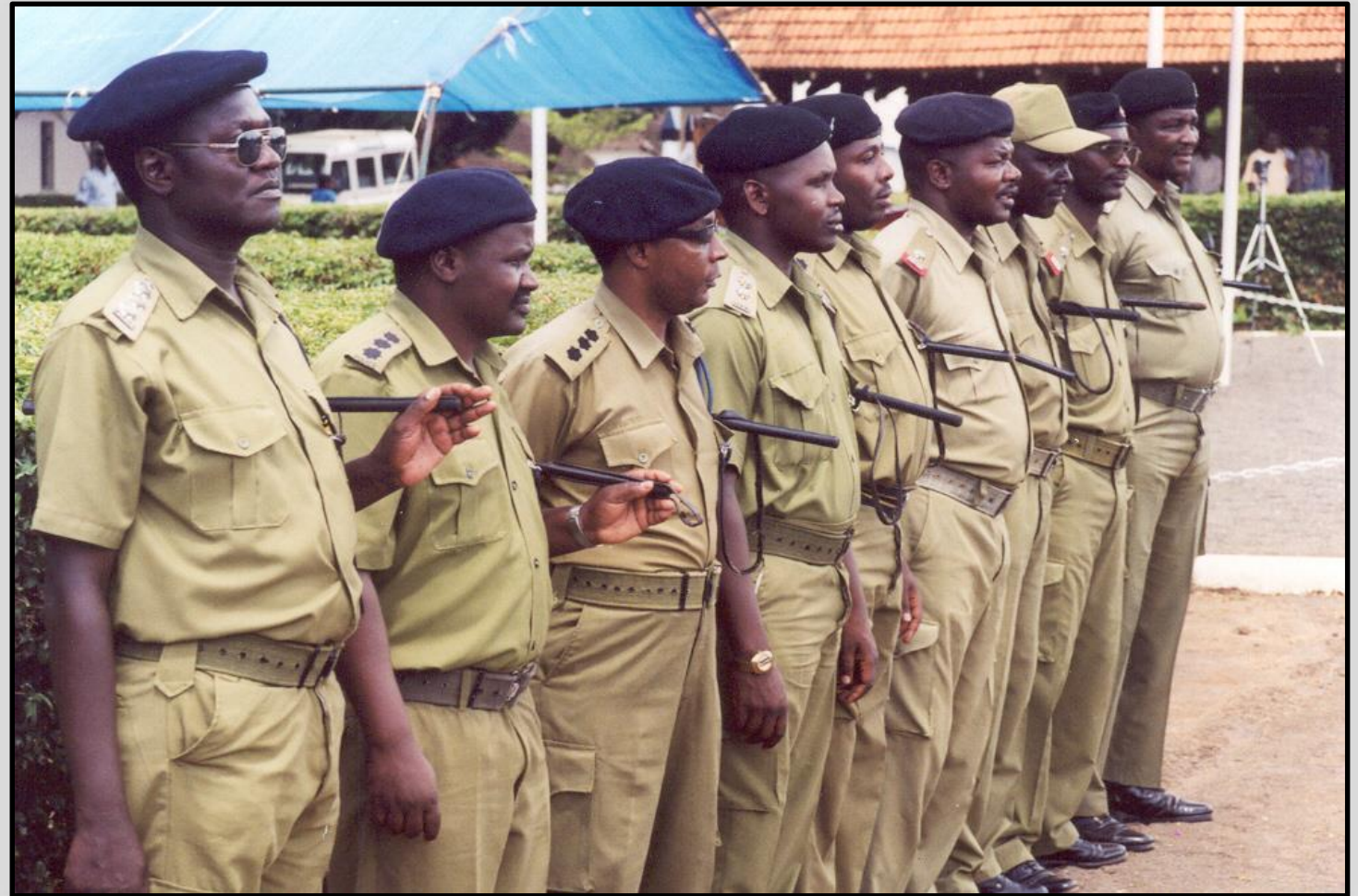
ICITAP Public Order Management Training – Tanzania