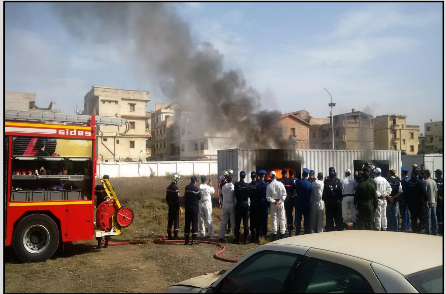
ICITAP Fire Scene Forensic Investigation Training – Algeria