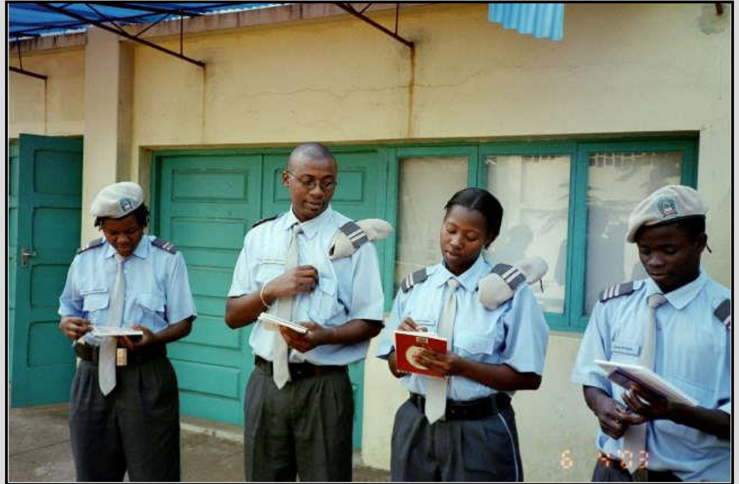
ICITAP First Responders Training – Mozambique