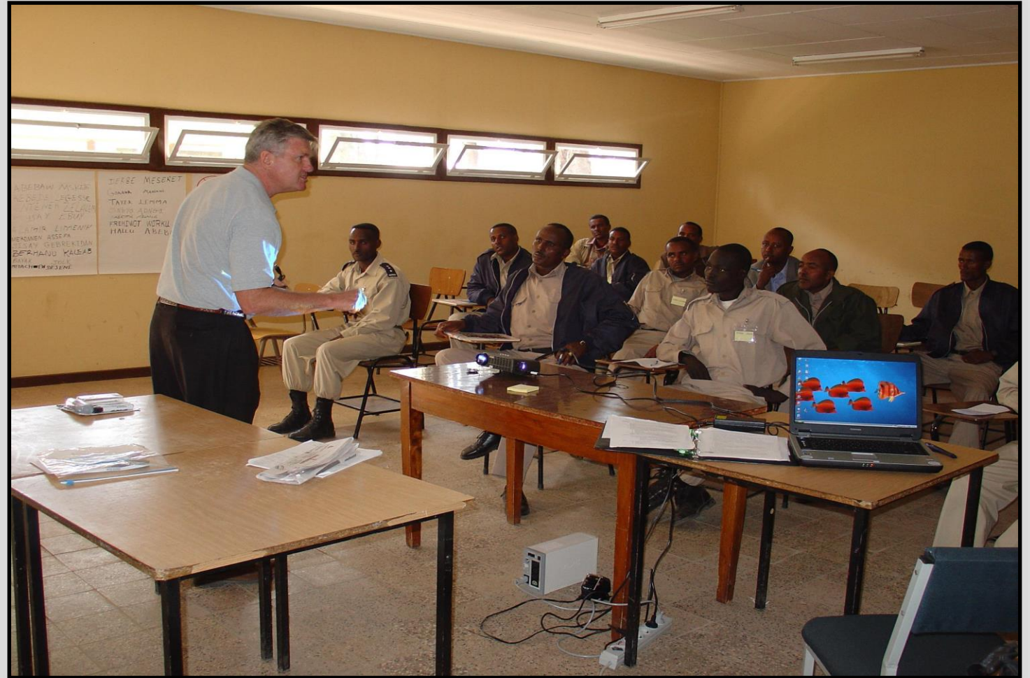
ICITAP Basic Skills Development Training – Ethiopia