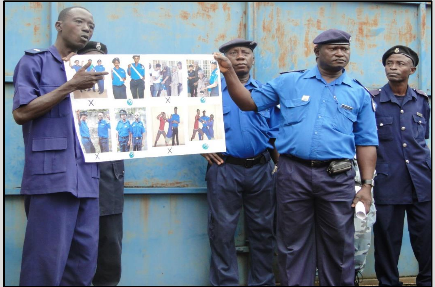
ICITAP Elections Security Training – Sierra Leone