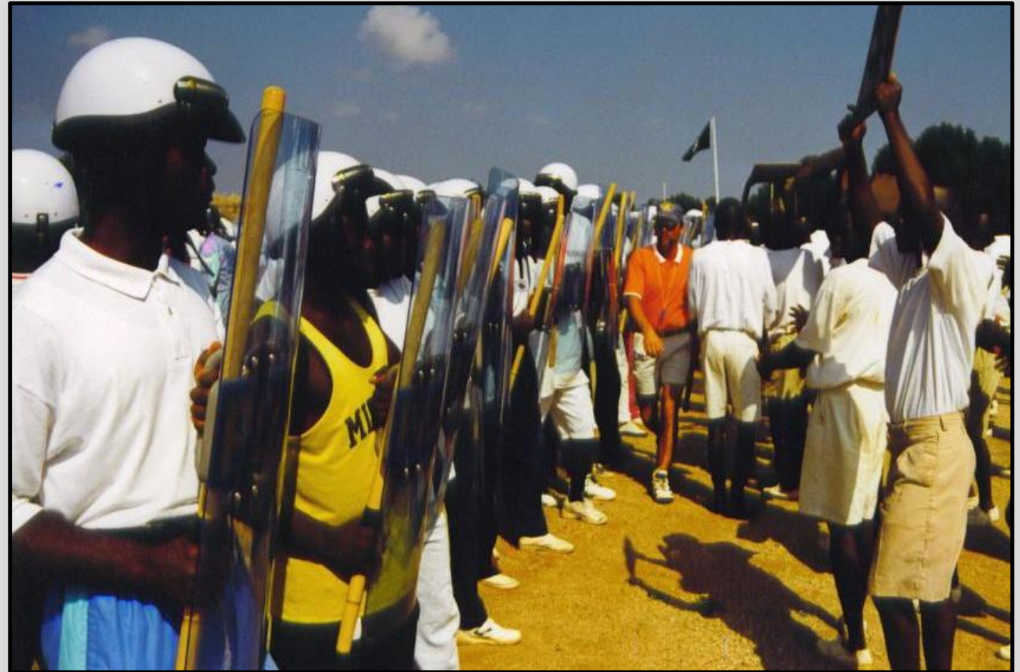
ICITAP Civil Disorder Management Training – Ghana