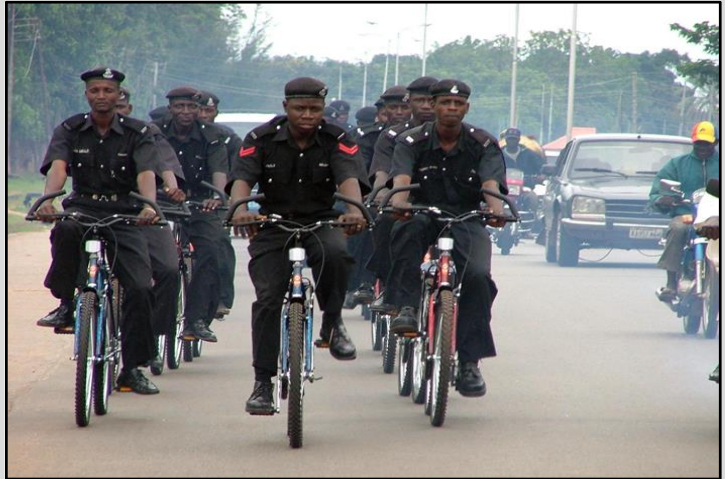
ICITAP Police Bike Patrol – Nigeria